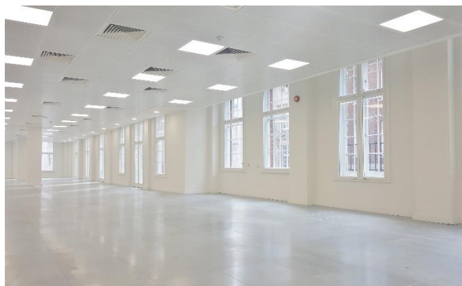
* Picture showing the 1st floor front refurbishment